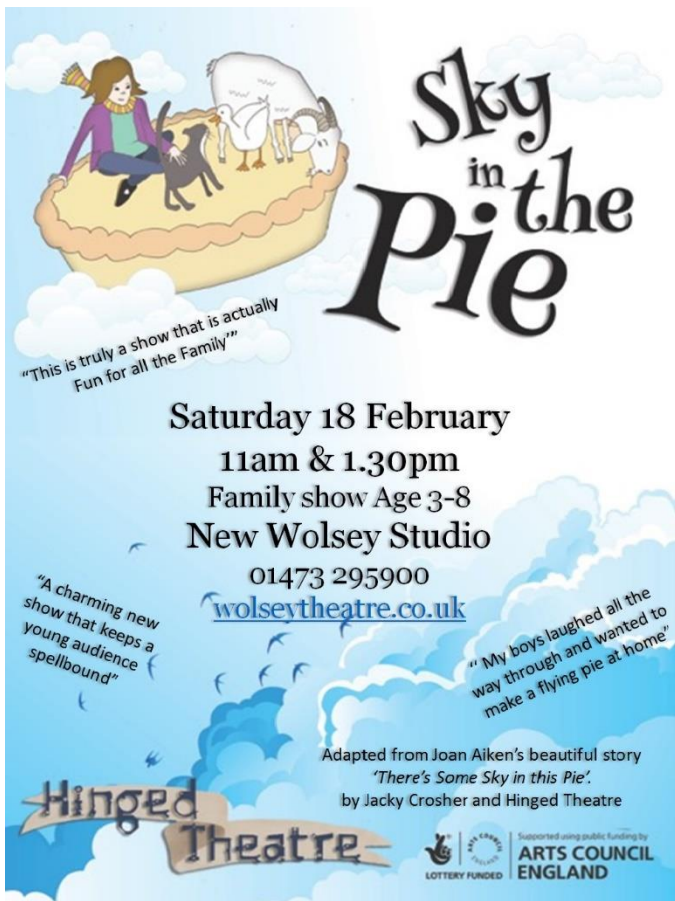
Poster with example overprint